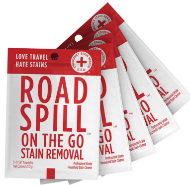
Road Spill 5 Pack Towelette