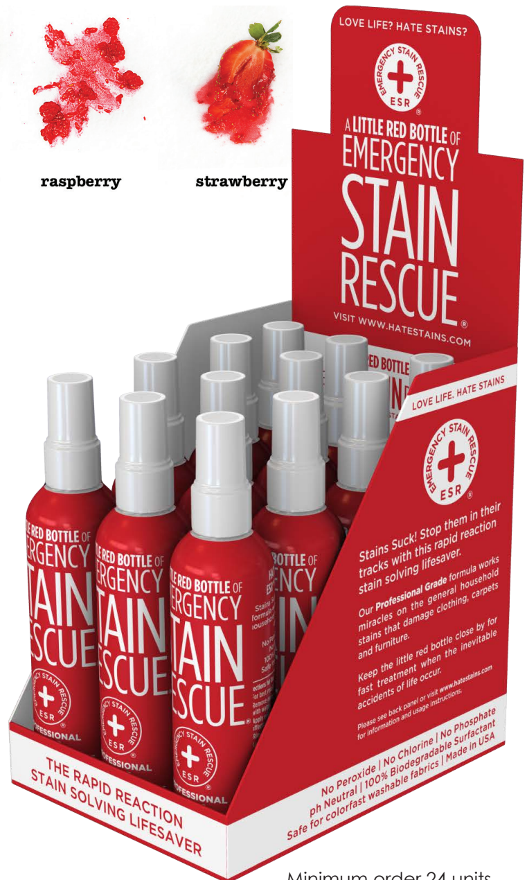
Minimum order 24 units