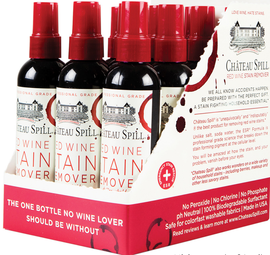
Minimum order 24 units

No Peroxide | No Chlorine Bleach | No Phosphates