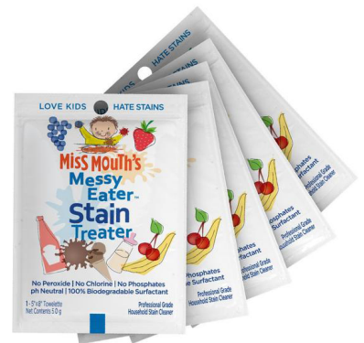
Miss Mouth's 5 Pack Towelette