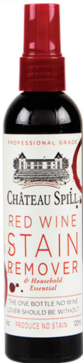
120ml per bottle