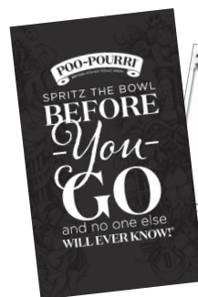
Poo-Pourri Instruction Cards (20) • 3" x 5" IC-2015

Pull shoppers into your store by promoting that you sell Poo-Pourri.