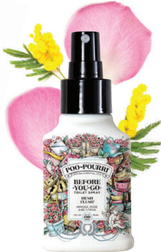
hush FLUSH ® new! mimosa + rose + citrus Available in: 2oz • 4oz