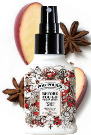
spiced APPLE apple + pecan + citrus Available in: 2oz • 4oz