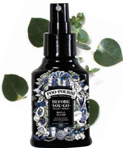
royal FLUSH ® eucalyptus + spearmint Available in: 10mL • 2oz • 4oz