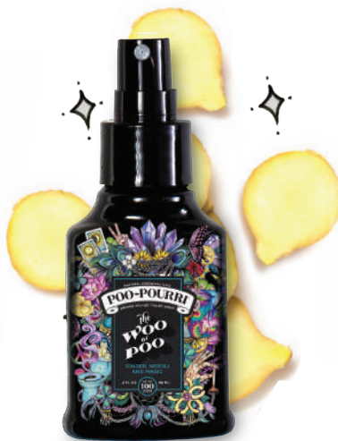
the woo of POO ® ginger + neroli + magic Available in: 2oz