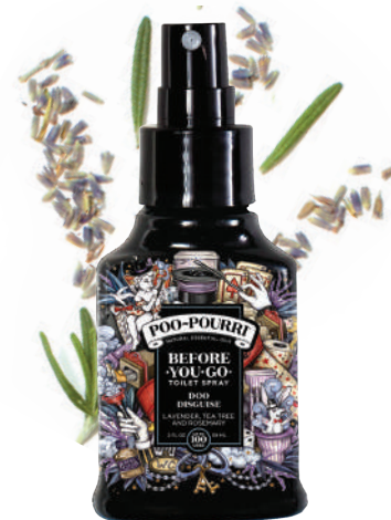
doo DISGUISE ® new! lavender + tea tree + rosemary Available in: 2oz • 4oz