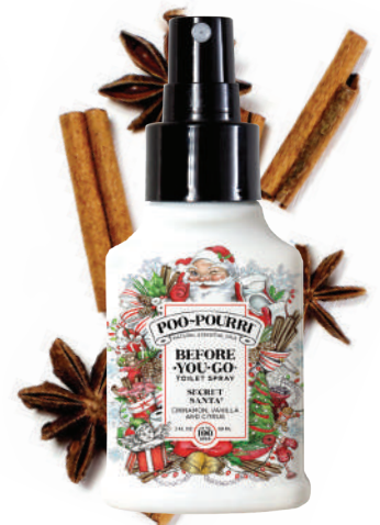
secret SANTA ® cinnamon + vanilla + citrus Available in: 2oz • 4oz