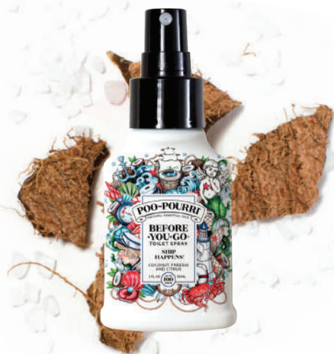
ship HAPPENS ® coconut + freesia + citrus Available in: 2oz • 4oz