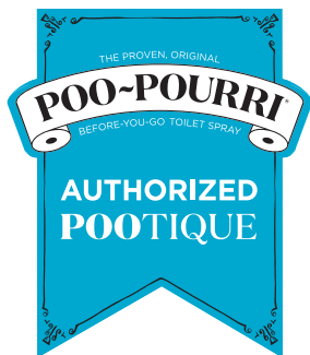
Authorized Pootique Window and Mirror Cling • 7" x 8" VINYL-2016

WITH THESE INFORMATIVE POINT OF SALE ITEMS