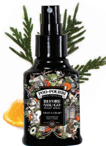
trap-a-CRAP ® cedarwood + citrus Available in: 2oz • 4oz