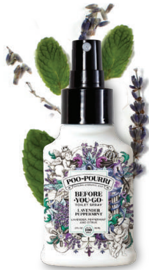
lavender PEPPERMINT lavender + peppermint + citrus Available in: 10mL • 2oz • 4oz