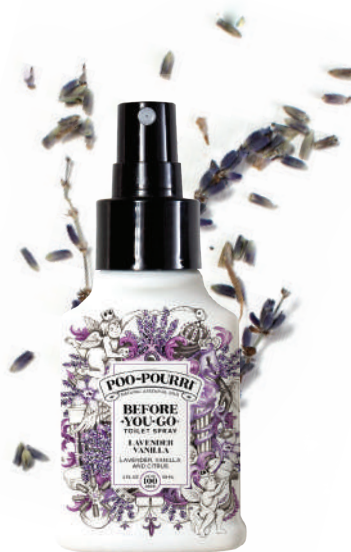
lavender VANILLA lavender + vanilla + citrus Available in: 10mL • 2oz • 4oz 8oz • 16oz