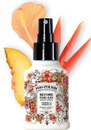
tropical HIBISCUS hibiscus + apricot + citrus Available in: 10mL • 2oz • 4oz