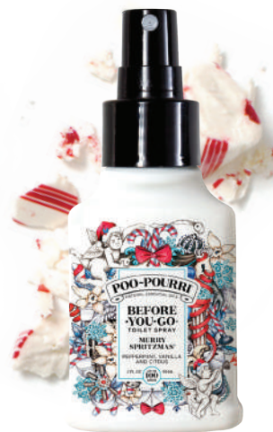
merry SPRITZMAS ® peppermint + vanilla + citrus Available in: 2oz • 4oz