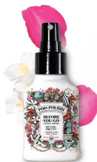
sitting PRETTY ® jasmine + rose + citrus Available in: 2oz • 4oz