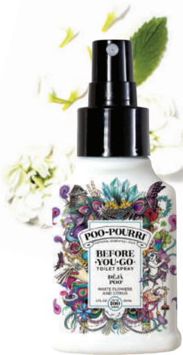
deja POO ® white flowers + citrus Available in: 2oz • 4oz