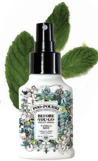
vanilla MINT vanilla + mint + citrus Available in: 10mL • 2oz • 4oz