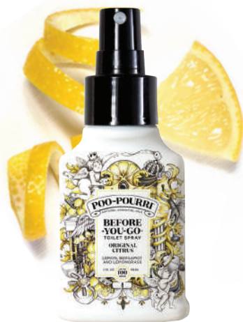
original CITRUS lemon + bergamot + lemongrass Available in: 10mL • 2oz • 4oz 8oz • 16oz