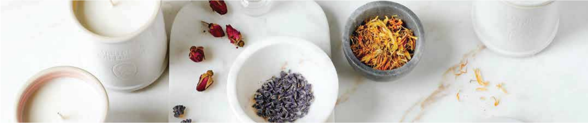
LAVENDER CLARY SAGE