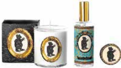
BEAR COLLECTION One Case Pack of each Item 12 Pieces