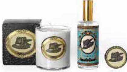
FEDORA COLLECTION One Case Pack of each Item 12 Pieces