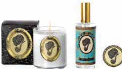
PIPE COLLECTION One Case Pack of each Item 12 Pieces