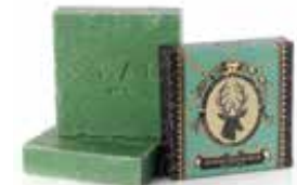
SHEA BUTTER SOAP 6 oz Handmade Shea Butter Soap 6 per case

PATCH NYC COLLECTION STARTER KIT Includes a Case Pack of each item in Patch NYC + Matches. 82 Pieces