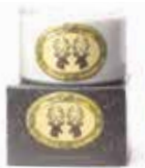
THREE-WICK SOY CANDLE 17 oz / 80 hr Burn Time Soy Candle 4 per case