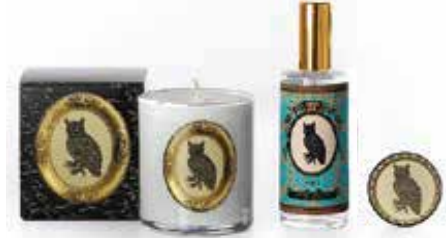
OWL COLLECTION One Case Pack of each Item 12 Pieces