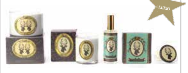
STAG COLLECTION One Case Pack of each Item 22 Pieces