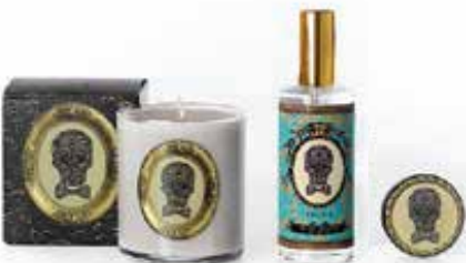
SKULL COLLECTION One Case Pack of each Item 12 Pieces