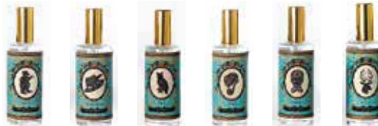
EDC-BEAR EDC-FED EDC-OWL EDC-PIPE EDC-SK EDC-STAG