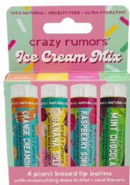
Ice Cream Mix