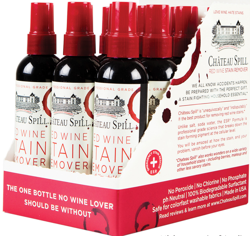
Minimum order 24 units

No Peroxide | No Chlorine Bleach | No Phosphates