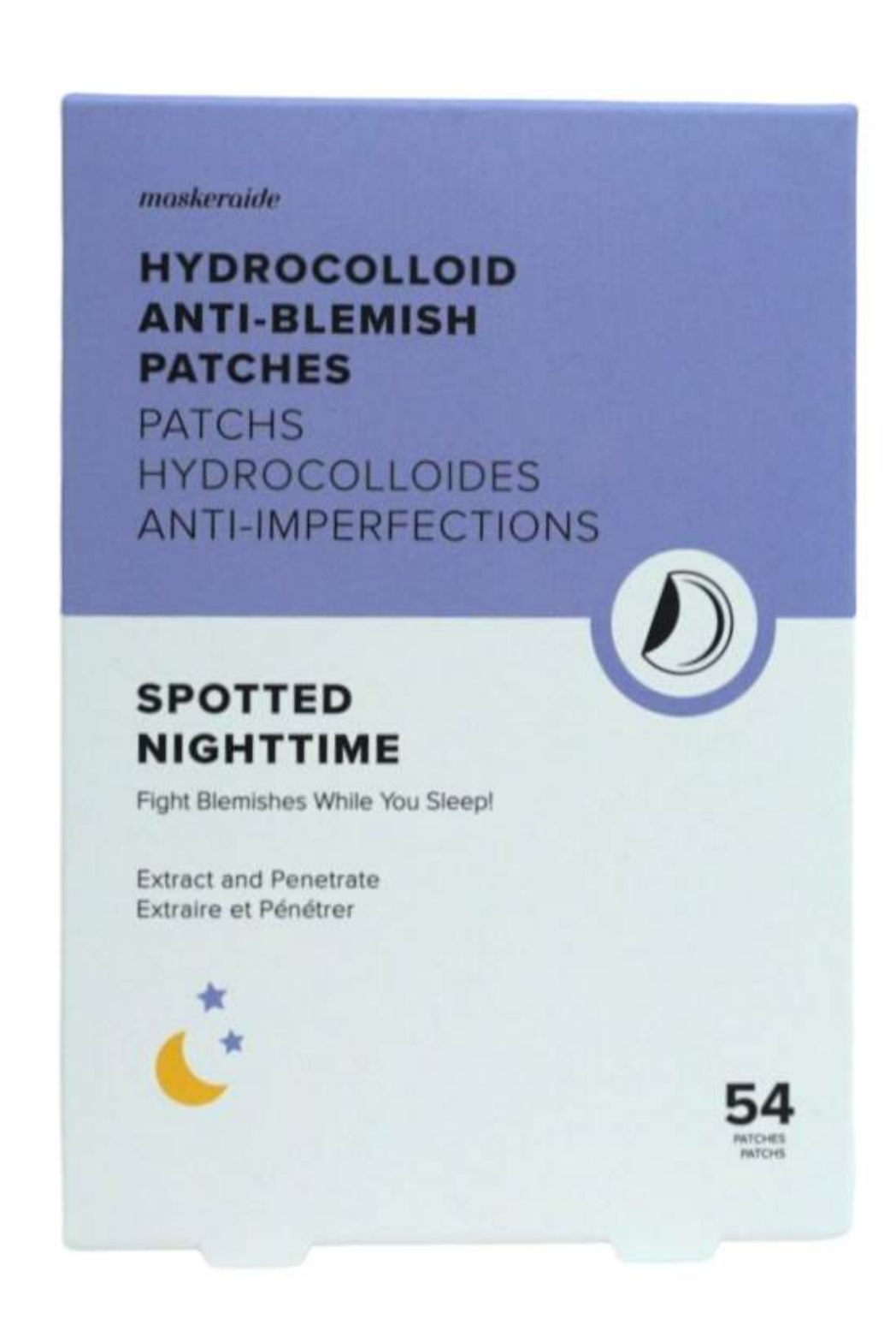
1 Box = 54 Patches

Our Spotted Nighttime Hydrocolloid Anti-Blemish Patches are our new overnight blemish fighting superhero. Their powerful skin-clearing formula extracts sebum from the skin and penetrates deeply to remove all traces of oil and debris.