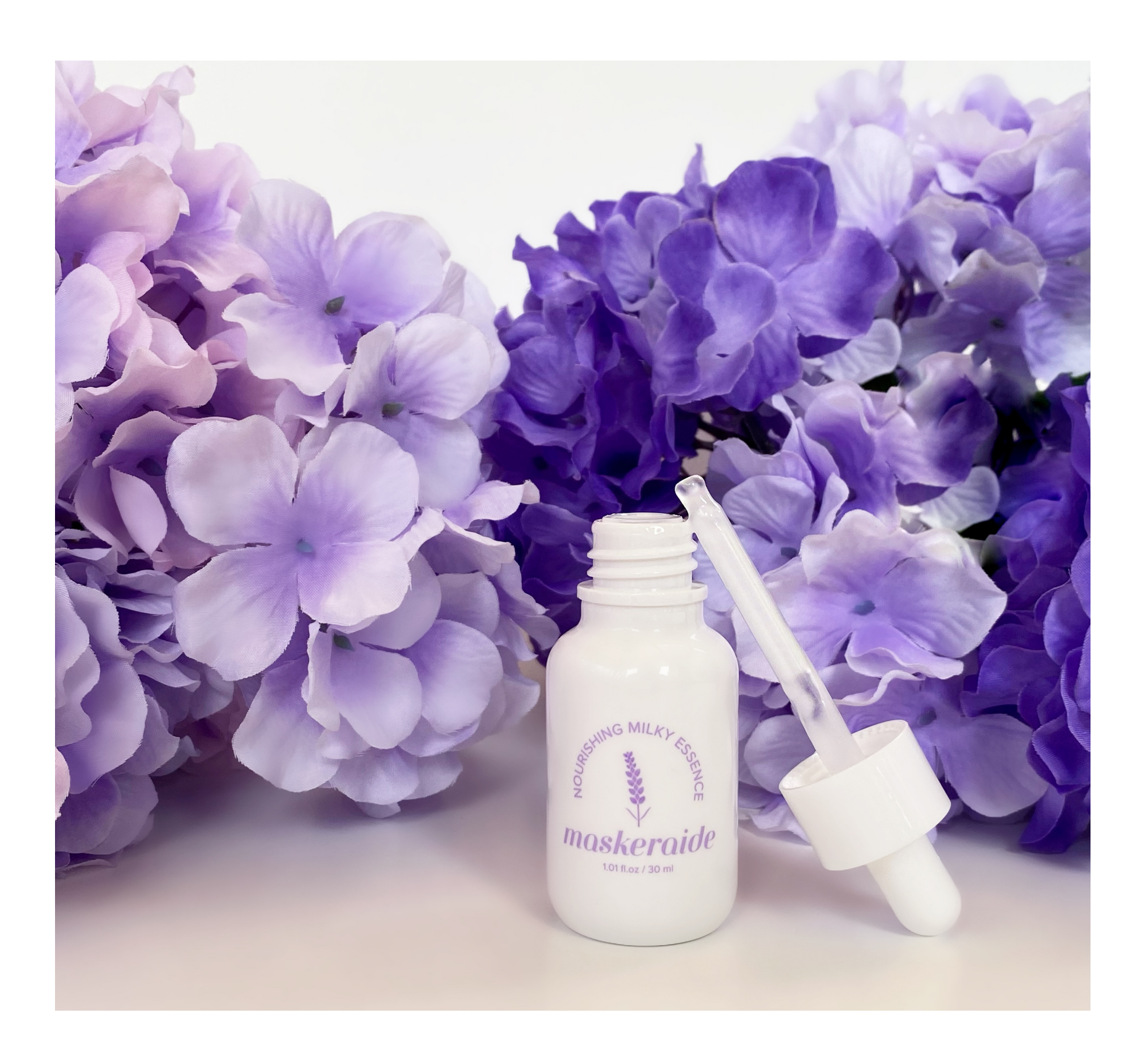
1 Bottle = 1.01 \, fl / 30 \, ml

Our Nourishing Milky Essence is going to be your skin's new BFF! It's smooth & silky milk texture deeply nourishes the face, leaving your skin feeling softened and plumped.