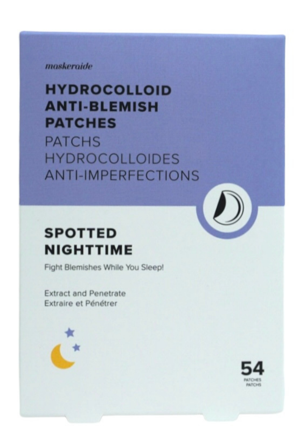
1 Box = 54 Patches

Our Spotted Nighttime Hydrocolloid Anti-Blemish Patches are our new overnight blemish fighting superhero. Their powerful skin-clearing formula extracts sebum from the skin and penetrates deeply to remove all traces of oil and debris.